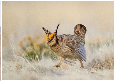
BURROWING OWLS, CATTLE AND PRAIRIE-CHICKEN